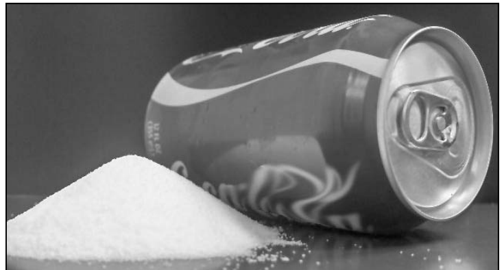
Above: One can of soda contains about 8 teaspoons of sugar, which is 140 calories.

For more information, read: A Scientific Statement From the American Heart Association Circulation, Sep 2009; 120: 1011 - 1020.